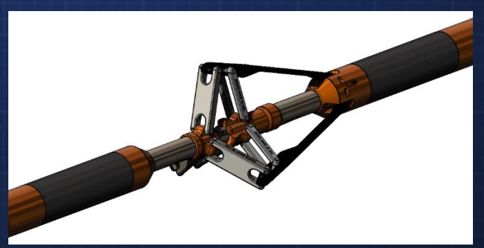
Figure 2 WWT Extreme Expansion Gripper assembly