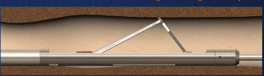
Figure 2 WWT Eccentric Link Gripper