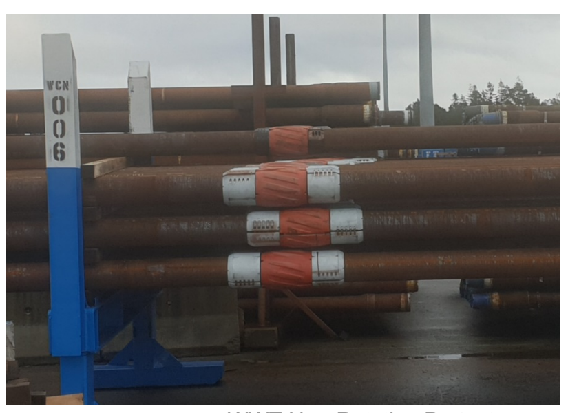
WWT Non-Rotating Protectors www.wwtco.com