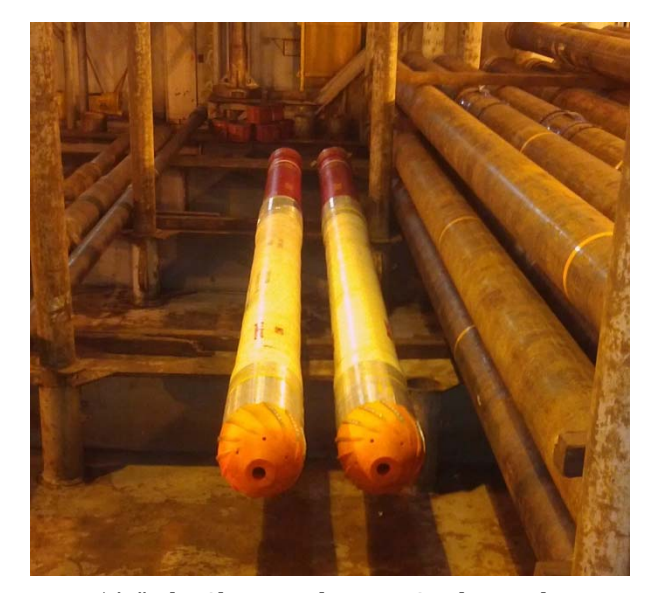
Two 9-5/8" FlexShoes with ReamGuide, ready to go.

Solution: WWT FlexShoe w/ReamGuide Results: Smooth casing run to bottom.